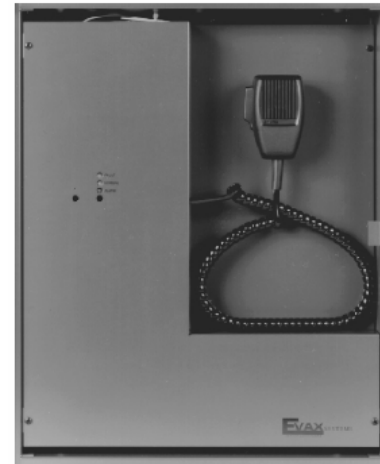
GFV-5025/5050/5100 Series Shown with the door removed

V-Force 5000 series voice evacuation panels can be configured for Churches, Restaurants, Movie Theaters, Auditoriums, and High Rise buildings.