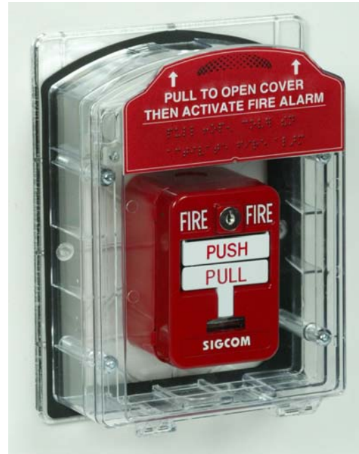
Model ST-FRC01 w/ST-XTR01

For applications where the manual pull stations are mounted on a surface that is rough, simply add the back-plate for easy mounting.